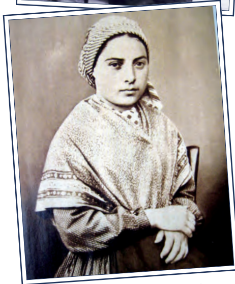
Top: Adele Brise